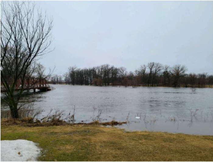
Hole 18 on 4/23/22 ^